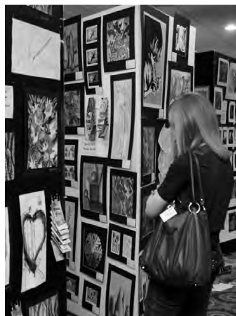
2011 Conference Student Exhibit

Deadline to register for this exhibit is November 1, 2012