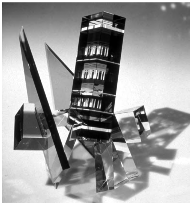
Principles of Reality, Glass, 30X27X23in.

Luce Center for American Art, Washington, DC; Sung - Jin Glass Museum, Kimpo, Korea; Corning Museum of Glass, Corning, New York; Rochester Memorial Art Gallery, New York; National Museum of Glass, Vanderbilt University, Nashville, Tennessee; Alternative Sculpture Space, New York, New York; Coca Cola Corporation, Atlanta, Georgia; Eastman Kodak Corporation, Rochester, New York; National Museum of Glass, Leerdam, Netherlands; Kunsthaus Am Museum, Köln, Germany; High Museum of Art, Atlanta, Georgia; and many other public and private collections.