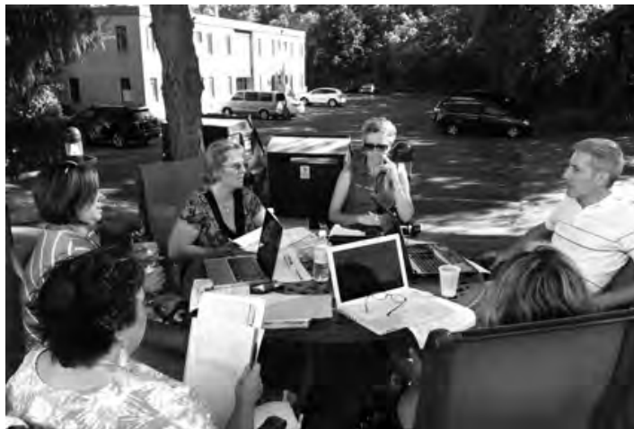
NYSATA APPR Task Force members work on SLO development this past summer.

* All participants who attend the Pre Conference will receive a certificate of participation for 6 hours of coursework. (Please check with your school district for any prior approval necessary.)