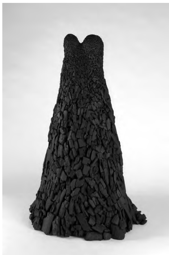
Martyr Dress 1, Lump charcoal, a bra, glue, resin, paint over a metal armature 55.5in x 36in x 50in, 2010